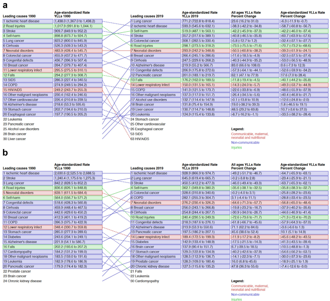
Fig. 1: A: 20 leading Level-3 causes of YLLs in France, with percent change, both sexes 1990–2019. B: 20 leading Level-3 causes of YLLs in Western Europe, with percent change, both sexes 1990–2019.

2019 with 645 (619–666) age-standardised YLL rate per 100,000 population (Fig. 1B). Lung cancer mortality measured by YLL has decreased in France by 6% and in Europe by 23% over the 30 years. Among neoplasms, colorectal cancer was the second leading Level-3 cause in 1990 and 2019 in France and in Europe and decreased by 32 and 26% respectively (Fig. 1A and B).